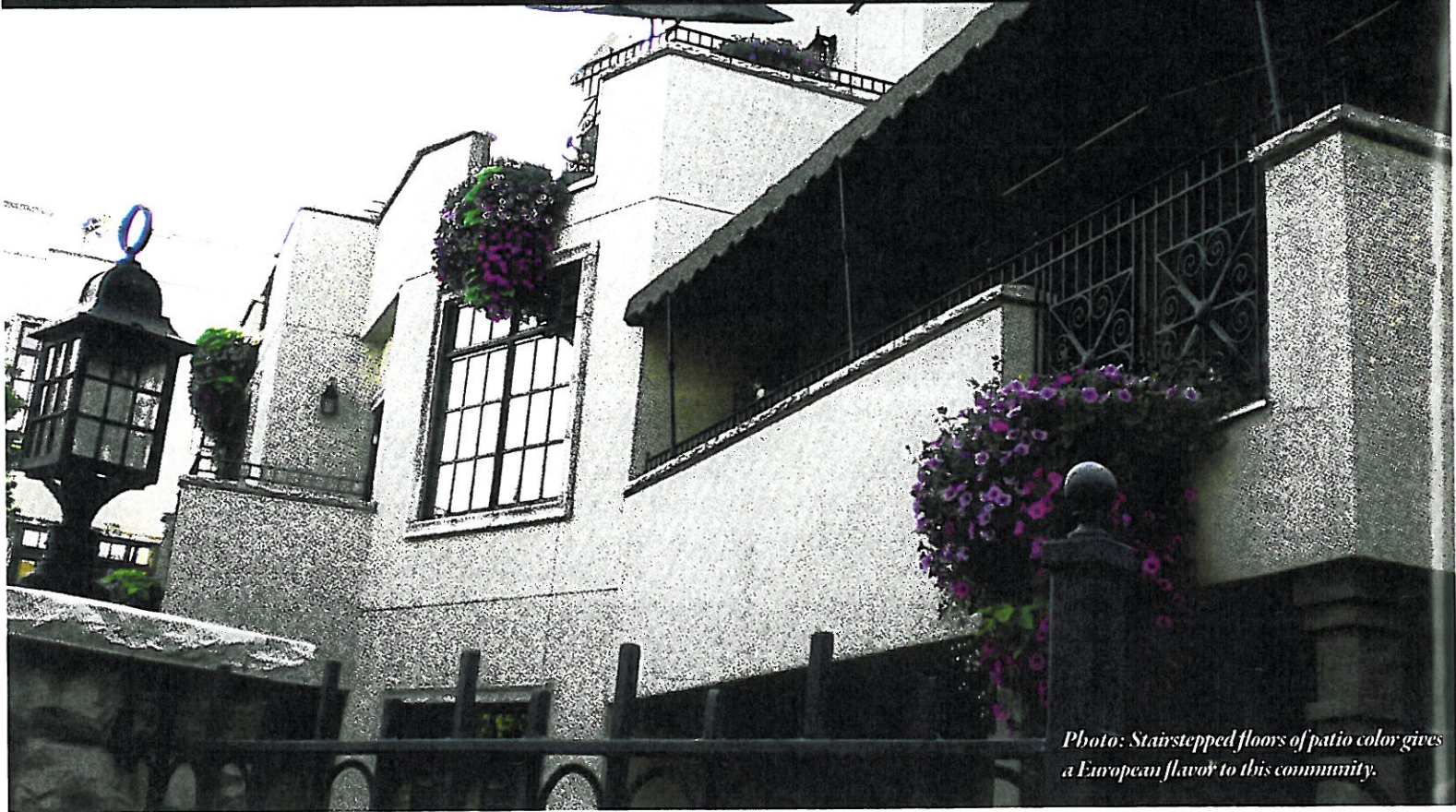
Photo: Stairstepped floors of patio color gives a European flavor to this community.

Greenleaf Landscaping Scores At Riverside Court